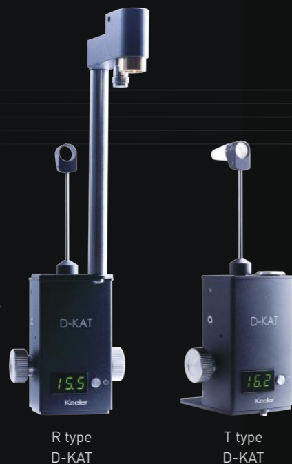
R type D-KAT

The R type is fitted to a mounting post, located on the optics block, and can be swung in and out for use, as required.